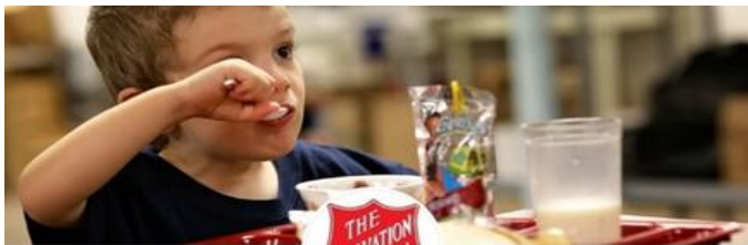
Boonslick Salvation Army - Cooper & Howard Counties 49 likes • 88 followers

Boonslick Salvation Army – Cooper & Howard Counties is asking for help to grow their Facebook Page. If you are active on Facebook, please go to their Facebook Page and “Like” them and/or “Follow” them. This way they can keep more of their community updated on the services that they offer to friends and neighbors.